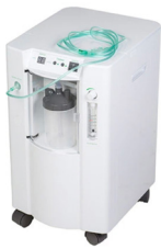
At Home Concentrator