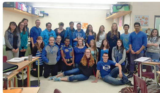
Students at Leduc Composite High School, Leduc, Alberta, Canada