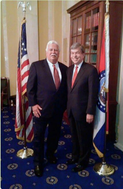
Doug Jones (left) and Senator Roy Blunt (right).

“This is my way of paying back and paying forward. I’m alive today because of the work done at the NIH, funded in part by Congress. I want the people following me to have access to better treatments and better medications.”