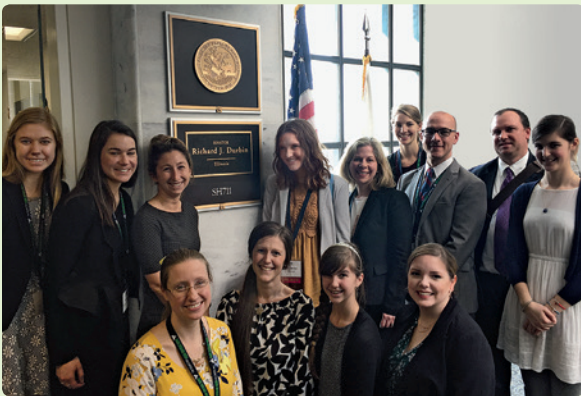
PFF Daughters, staff at the PFF, and representatives of numerous rare disease organizations gather outside of Illinois Senator Dick Durbin's office.

No one is more invested in ending pulmonary fibrosis (PF) than individuals and families affected by the disease. An innovative Pulmonary Fibrosis Foundation (PFF) program, PFF Daughters, harnesses that commitment with a network of leaders, volunteers, advocates, and fundraisers dedicated to helping the PFF fulfill its mission.