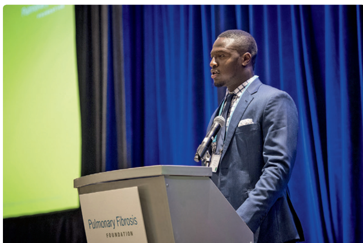
Howard delivers a speech declaring his commitment to the PF community at the PFF Volunteer Meeting.

Jordan Howard, 22-year-old Chicago Bears running back, has joined the Pulmonary Fibrosis Foundation (PFF) in the fight against pulmonary fibrosis (PF). Howard announced his commitment to the PF community at the PFF Volunteer Meeting on November 9, 2016. A number of major news outlets were present to cover Howard's speech.