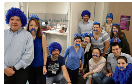
Staff at the Dorothy P. and Richard P. Simmons Center for Interstitial Lung Disease at UPMC