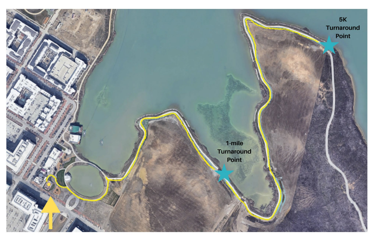
Start and Finish